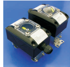
Model EAE (S. 6)