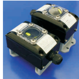
Model EAP (S. 5)